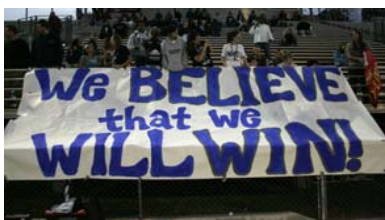
2006 North Gwinnett Game to determine Region Champions.....Norcross!